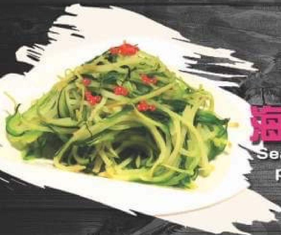
海藻土豆丝 Sea vegetable potato silk $5.49