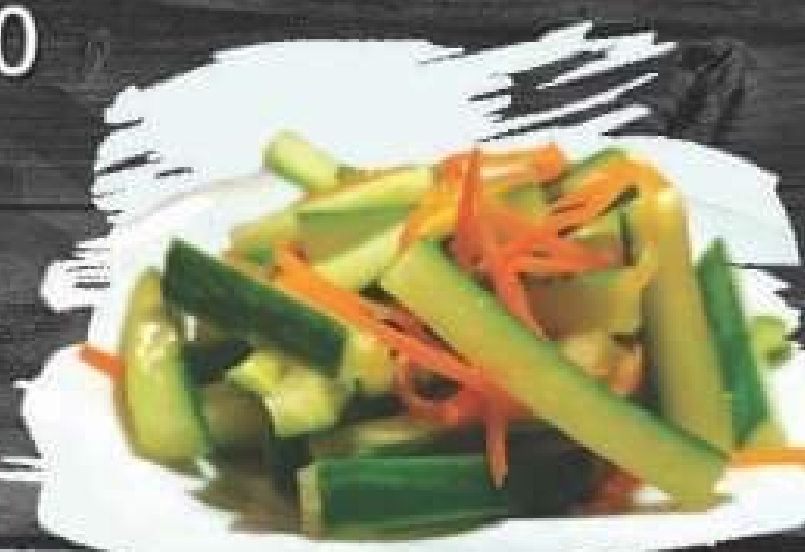
甜酸黄瓜 $5.49 Sweet and sour cucumber