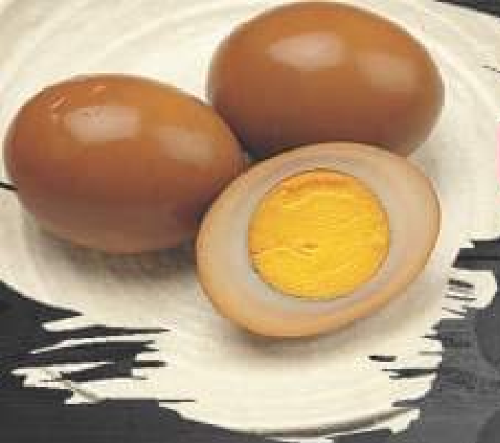
卤蛋 $1.50 Egg