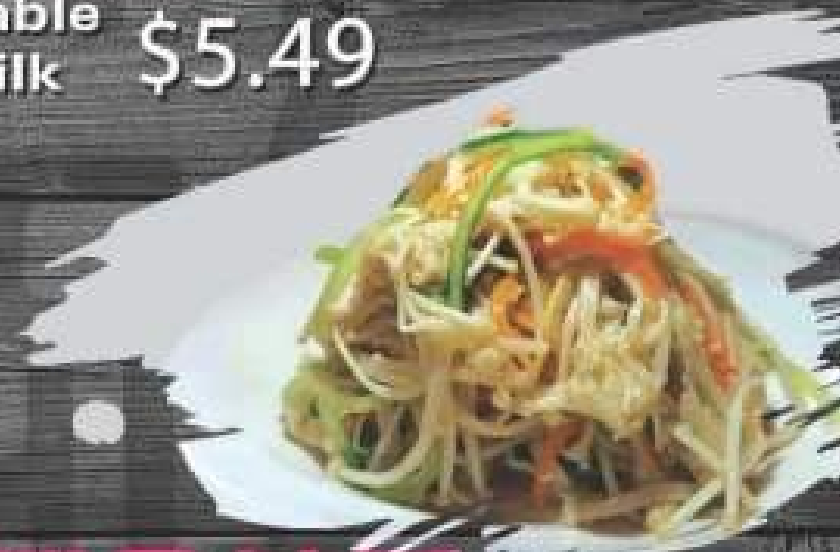
凉拌金针菇 $5.49 Golden mushroom and mixed vegetables